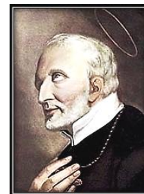
SAINT ALPHONSUS DE LIGUORI (FEAST DAY: 1 AUGUST)

O God, Who raised up Saint Ignatius of Loyola in Your Church to further the greater glory of Your Name, grant that by his help we may imitate him in fighting the good fight on earth and merit to receive him a crown in Heaven. Through our Lord Jesus Christ, Your Son, Who lives and reigns with You in the unity of the Holy Spirit, one God, for ever and ever. Amen.