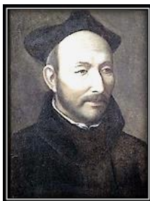
SAINT IGNATIUS OF LOYOLA (FEAST DAY: 31 JULY)

O God, Who made the Bishop Saint Peter Chrysologus an outstanding preacher of Your incarnate Word, grant, through his intercession, that we may constantly ponder in our hearts the mysteries of Your salvation and faithfully express them in what we do. Through our Lord Jesus Christ, Your Son, Who lives and reigns with You in the unity of the Holy Spirit, one God, for ever and ever. Amen.