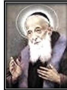
SAINT PETER CHRYSOLOGUS (FEAST DAY: 30 JULY)

Almighty ever-living God, Whose Son was pleased to be welcomed in Saint Martha's house as a guest, grant, we pray, that through her intercession, serving Christ faithfully in our brothers and sisters, we may merit to be received by You in the halls of Heaven. Through our Lord Jesus Christ, Your Son, Who lives and reigns with You in the unity of the Holy Spirit, one God, for ever and ever. Amen