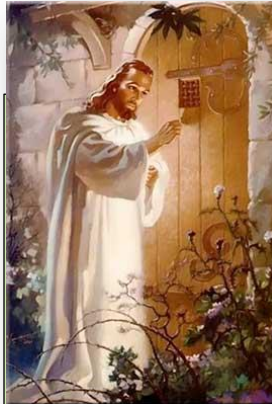
Fourth Station of the Cross

Jesus Meets His Mother. Consider, the meeting of the Son and the Mother, which took place on this journey. Jesus and Mary looked at each other, and their looks became as so many arrows to wound those hearts which loved each other so tenderly.