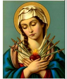
Fourth Station of the Cross

Jesus Meets His Mother. Consider, the meeting of the Son and the Mother, which took place on this journey. Jesus and Mary looked at each other, and their looks became as so many arrows to wound those hearts which loved each other so tenderly.